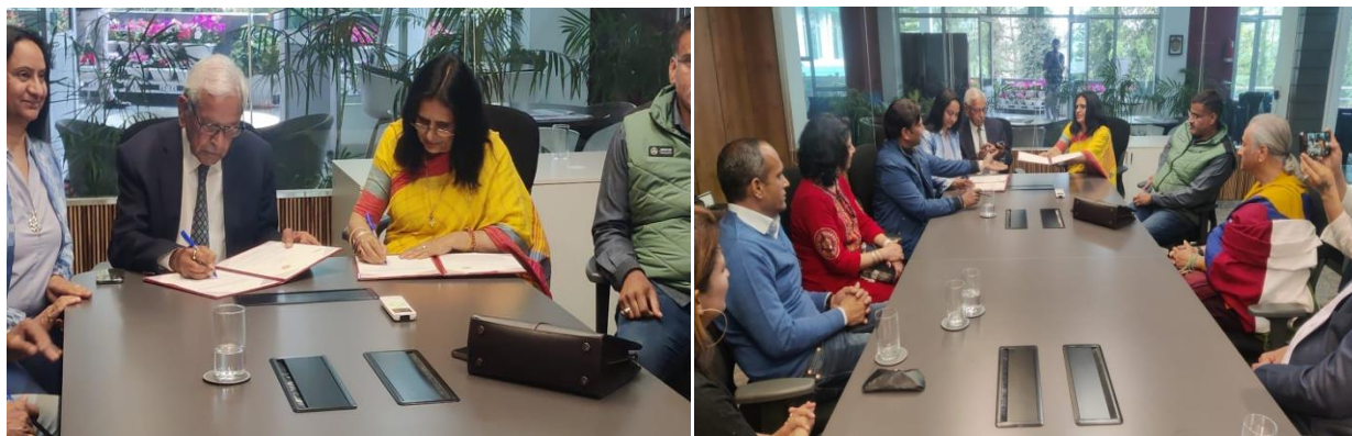
Signing of the MOU between RKMV and Shoolini University