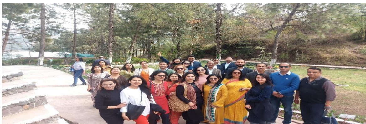
Field Visit to Shoolini University